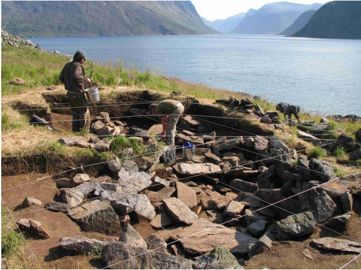
Excavation of a semi-subterranean sod, stone and whale bone house at Nachvak Village (IgCx-3), Nachvak Fiord, Labrador