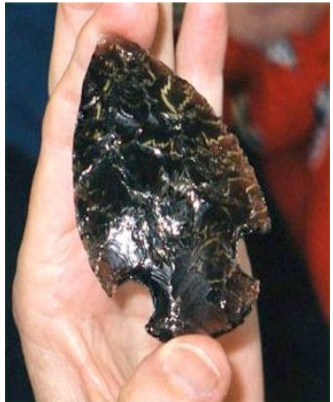
Finished Obsidian Point