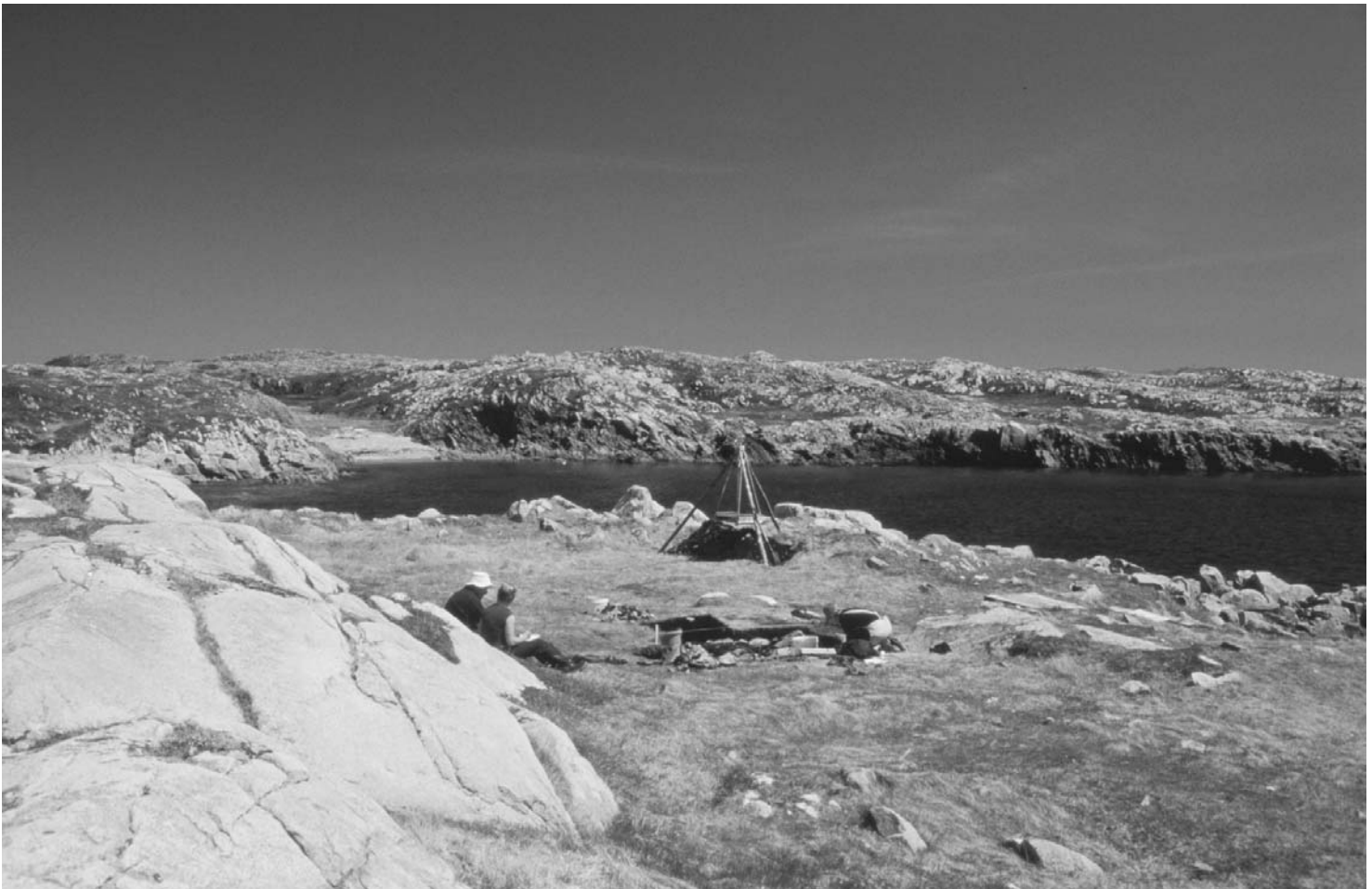
Excavation of the lower terrace, the Newman Site (DkAm-2).

The Newman site also contains a small but significant Groswater PaleoEskimo component (800 B.C to A.D. 100). Indeed, the site is the largest and richest prehistoric site known on Fogo Island to date. Groswater artifacts unearthed at the site included several hundred flakes, a core fragment and a dozen diagnostic tools—a side notched biface, seven endblades, a sideblade, a microblade, a scraper and a burin-like tool. The high proportion of endblades, the small size of most of the flaking debris and the relative absence of processing implements such as microblades may suggest that the Groswater occupants here were focused primarily on hunting related activities such as tool re-sharpening and scouting for seals. Indeed, many local residents have used the site to access and hunt harp seals in mid-winter and early spring. Moreover, excavations failed to uncover structural remains, midden deposits or hearth features. This would seem to support the interpretation that the site was used as a short-term staging area for hunters. Most of our excavations, however, were focused on the lower terrace; it is possible that evidence for a more intensive and extended Groswater occupation remains buried on the upper terrace. Plans are underway to return to the site in 2004 to explore this possibility and to collect information regarding historic land-use of the location. ↙