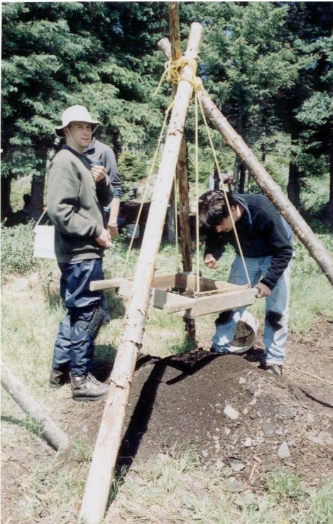
Fleur de Lys Field School, 2003

Plans for the summer of 2004 field school include a third year of excavations in Coachman's Cove and our continued survey of the Baie Verte Peninsula. For more information regarding the Fleur de Lys Archaeological Project, visit: http://www.ucs.mun.ca/~jerwin/fdl.htm .