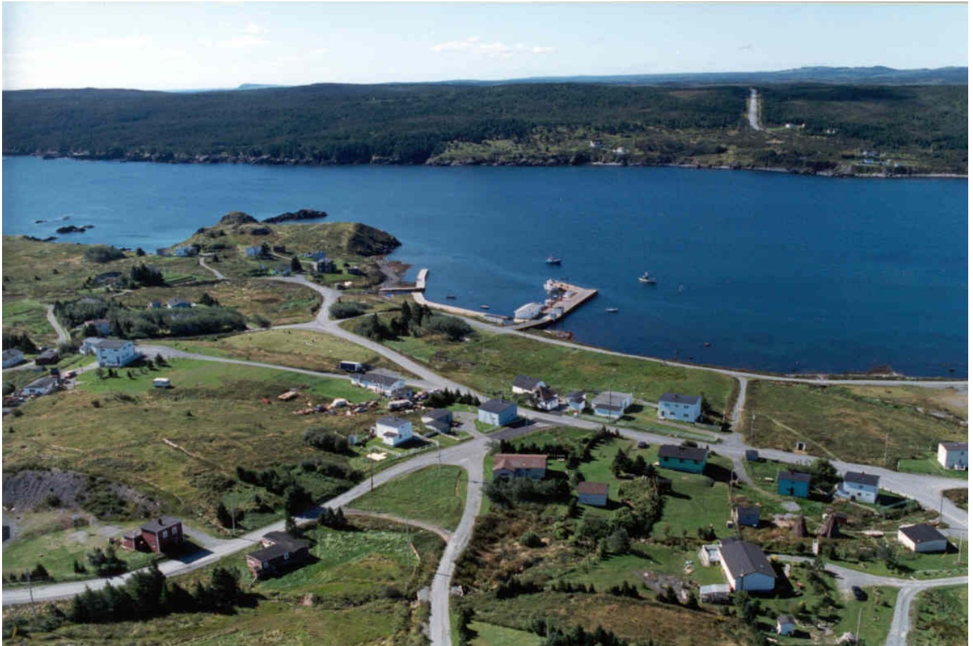
Lord's Cove, Renewa. The Goodridge site is 20 m in from the beach to the left of the Government wharf.