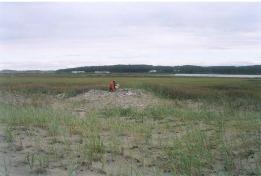
Lumsden Proposed Golf Course

No historic resources were discovered during these field programs. Based on the results of the background research and of the field program, it was concluded that the historic resources potential of these study areas appears to be lower than anticipated. It varies from low to moderate in both areas, but may include small localized areas of higher potential within lower-rated zones within the Pinsents Arm study area. The level of effort committed to date for the assessment of historic resources in these study areas is considered to be adequate. No further studies are deemed necessary as long as activities that have some potential to create ground disturbance do not occur near any sites reported during previous assessments in the vicinity of the road segments targeted for construction. ✎