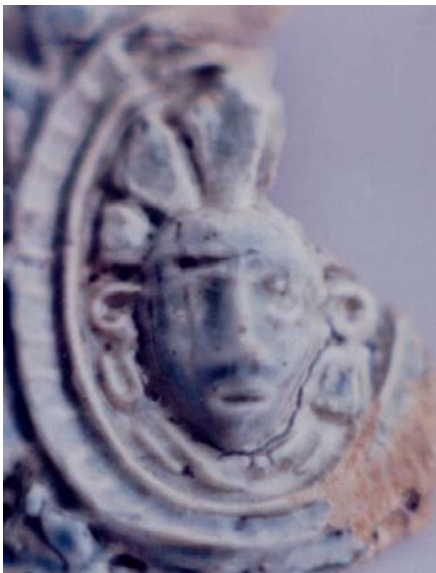
"Detail from Raeren Jug" Cupids 1600-1625