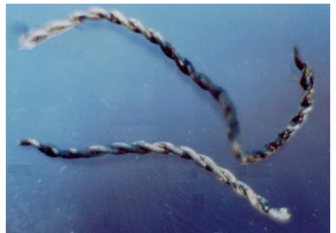
"Silver Threads" from Cupids