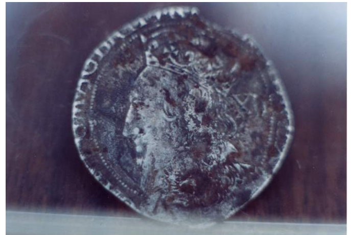
Charles I Silver 12 Shilling 1637- 1642 from Winterton