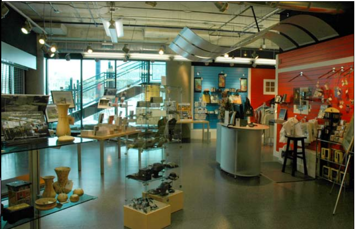
The Rooms Gift Shop