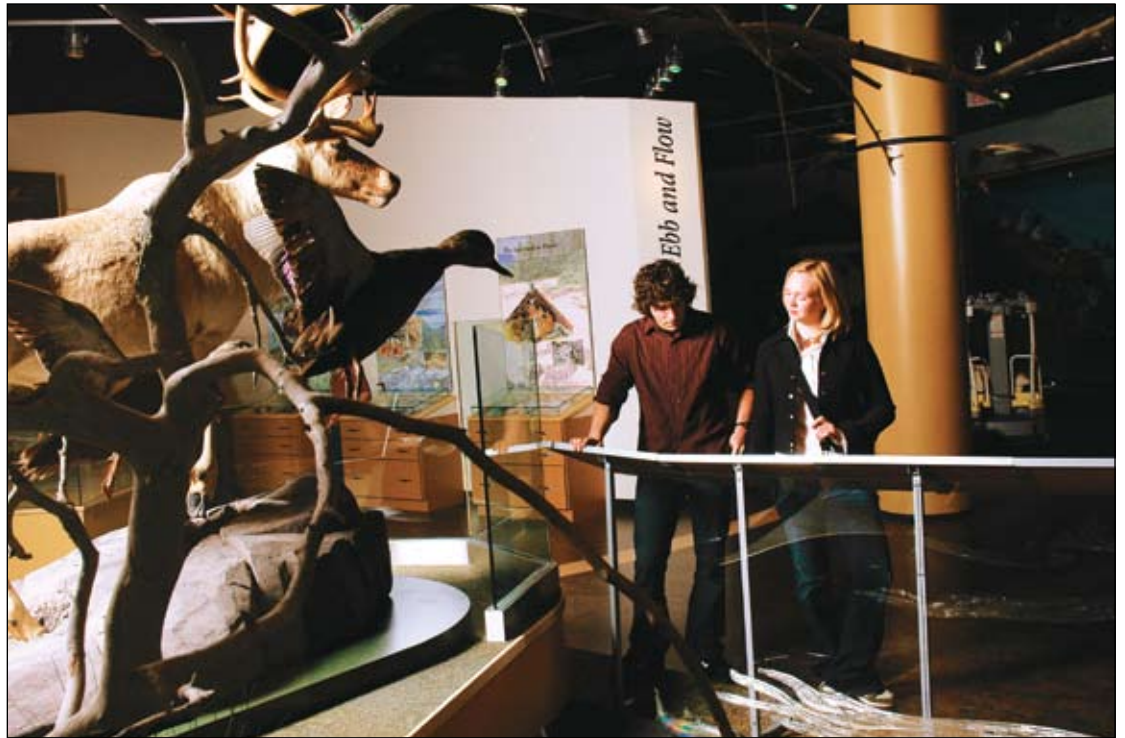
The Rooms Provincial Museum