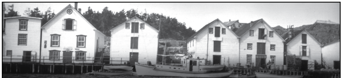
VA 15a-27.2 - The fishing rooms at Herring Neck

As a provincial cultural institution focused on the public interest, the main strategic priorities for The Rooms are education, public outreach and the presentation of temporary exhibits based on the provincial archival, contemporary and historic art, and museum collections entrusted to it by the Government of Newfoundland and Labrador.