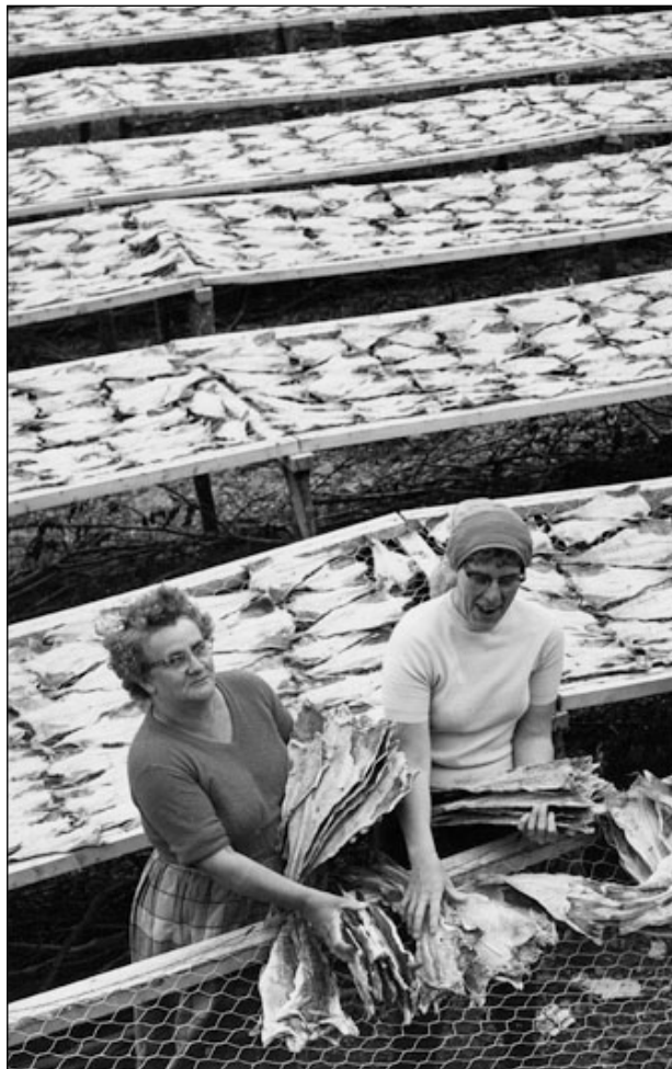
"The Rooms Provincial Archives, B 16-101, Collecting dried fish, Salvage, Bonavista Bay, Aug. 1963 / Chris Lund, courtesy of the National Film Board of Canada"

By March 31, 2011, The Rooms will have increased access and the quality of programs for more meaningful public interaction.