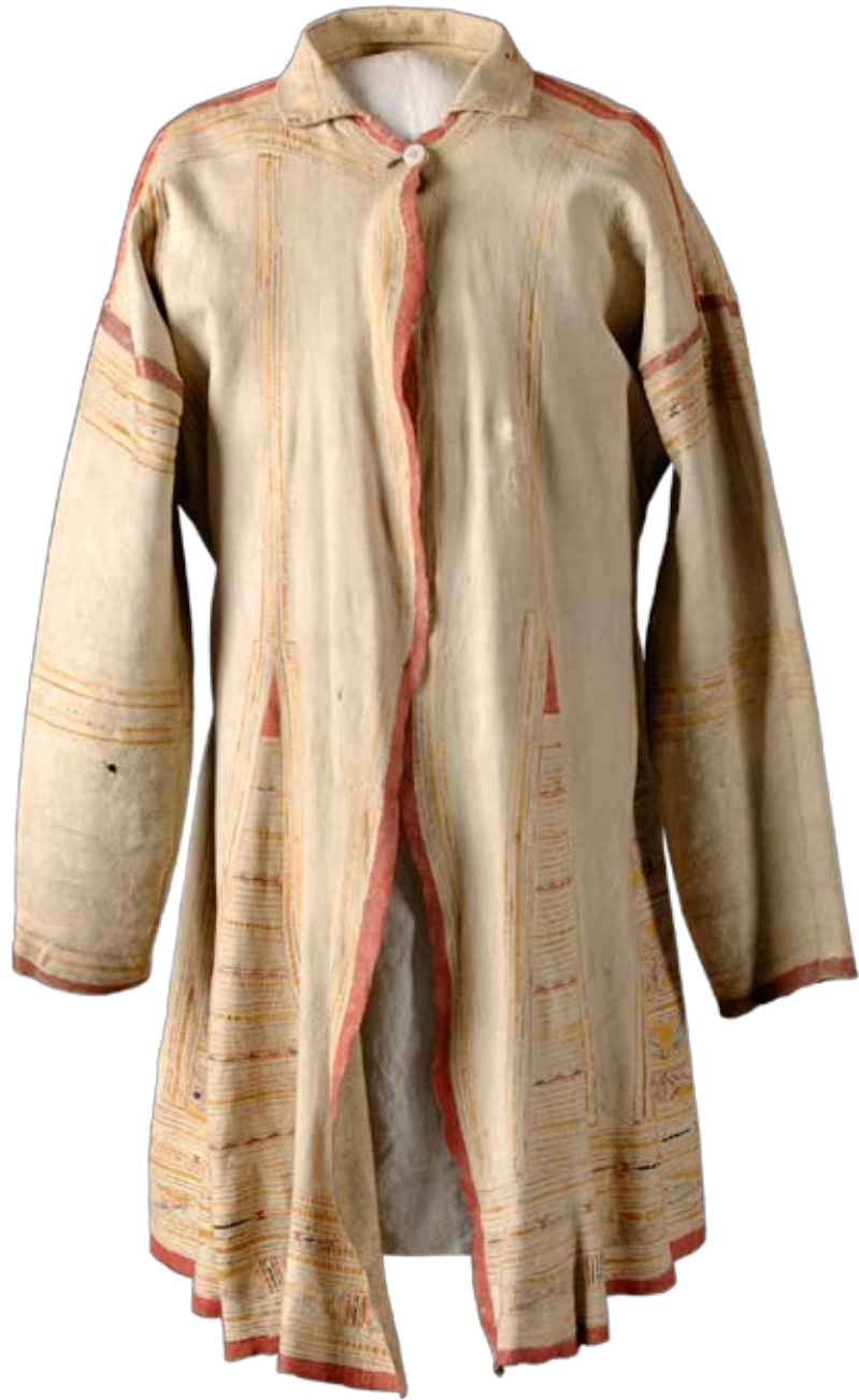
Innu painted skin coat, c.1775