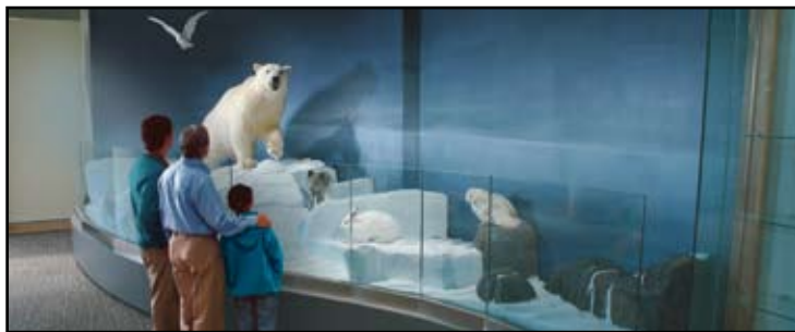
The Rooms Provincial Museum, Level 3 Permanent Exhibit