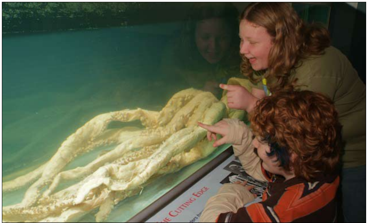
Giant Squid