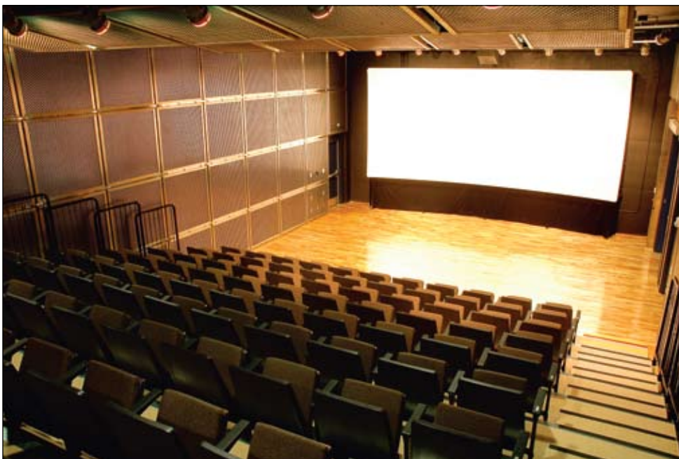
The Rooms Theatre

By March 31, 2011, The Rooms' Foundation Board of Directors/Campaign Cabinet will have taken significant action towards meeting requirements of the fundraising campaign.