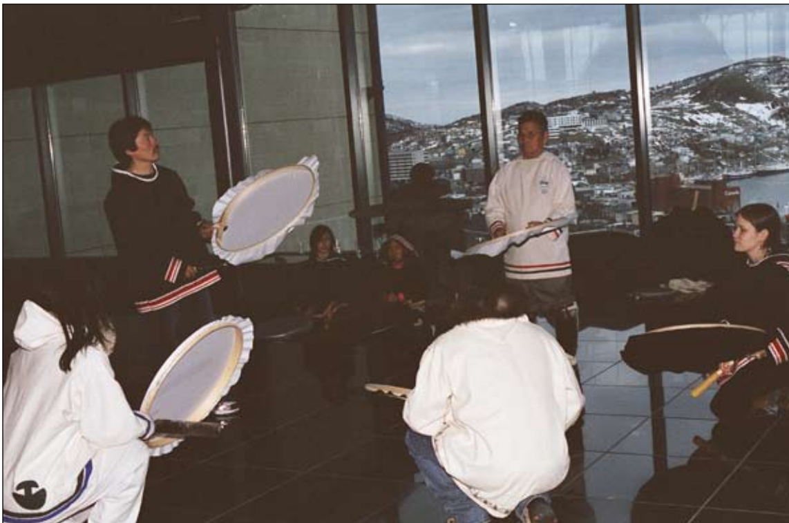
The Nippik Inuit Drummers at The Rooms, Photo: Sheilagh O'Leary