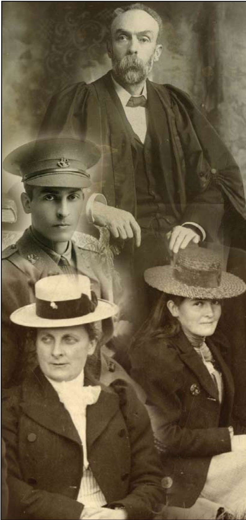
The Holloways; Newfoundland's First Family of Photography