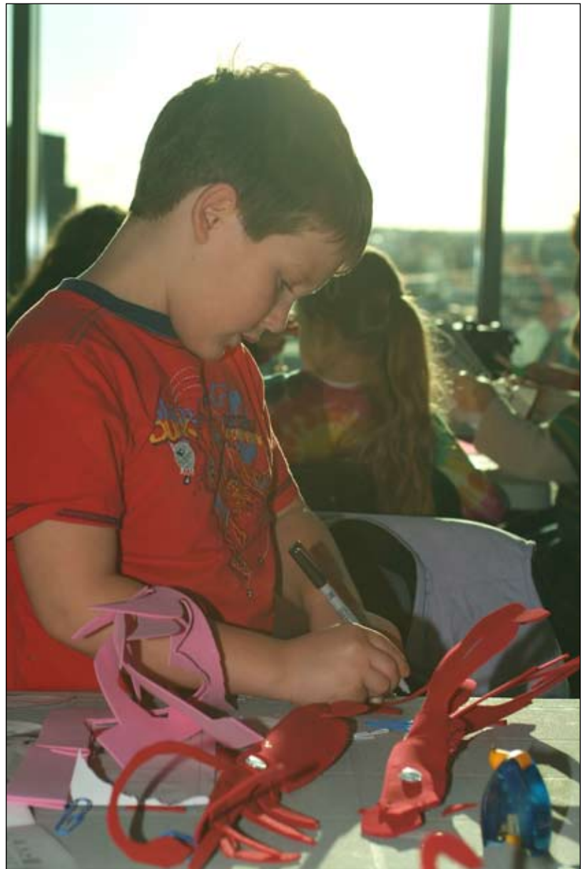
Kids making giant squids