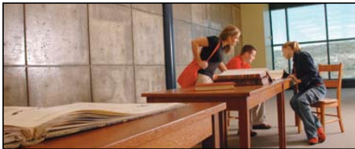
The Rooms Provincial Archives, Level 3 Reference Rooms