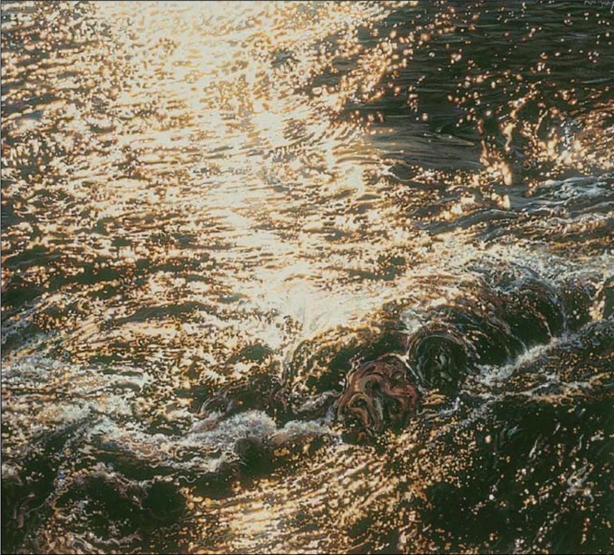
Ron Bolt, Flashdance Atlantic , 2003, Oil on canvas, The Rooms Provincial Art Gallery Collection 2005.5.0