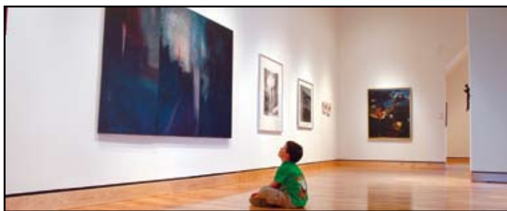
The Rooms Provincial Art Gallery, Level 4 Gallery