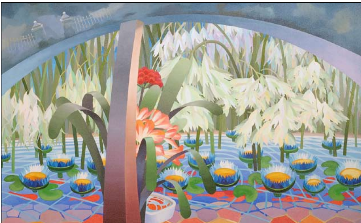
Peter Bell, Recollections II , 1988, The Rooms Provincial Art Gallery, Provincial Art Bank 143428

By March 31, 2011, The Rooms will have evaluated and updated the Governance Policy.